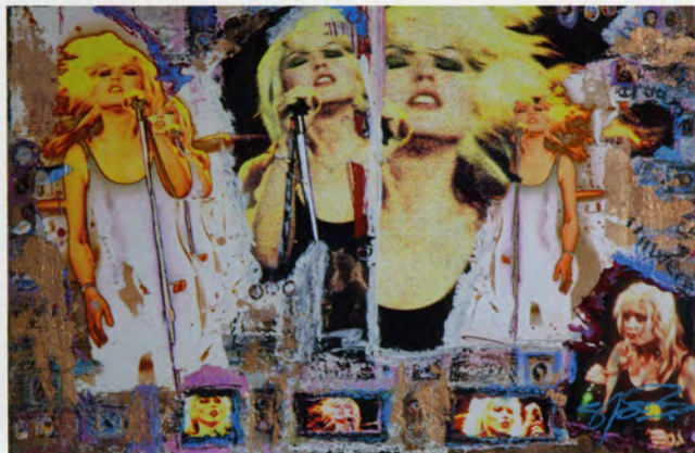
Steve Joester, "Blondie 1," mixed-media: photographs, oil stick, acrylic on canvas, 32" x 21". 2013 (Photographed in New York, 1978)

SJ: I always loved photography, but I remember seeing